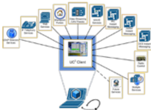
Unified portable user environment for all UC services